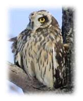
2 月の鳥 — 小耳木菟 (こみみずく) Bird of February– Short-eared Owl